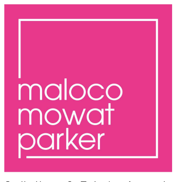
Solicitors & Estate Agents

Clarewood, Woodhead Street, High Valleyfield, Dunfermline, KY12 8SH