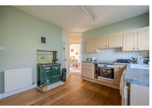
Enjoying a peaceful edge of village location, this lovely detached three bed bungalow enjoys wrap around garden, driveway & garage.