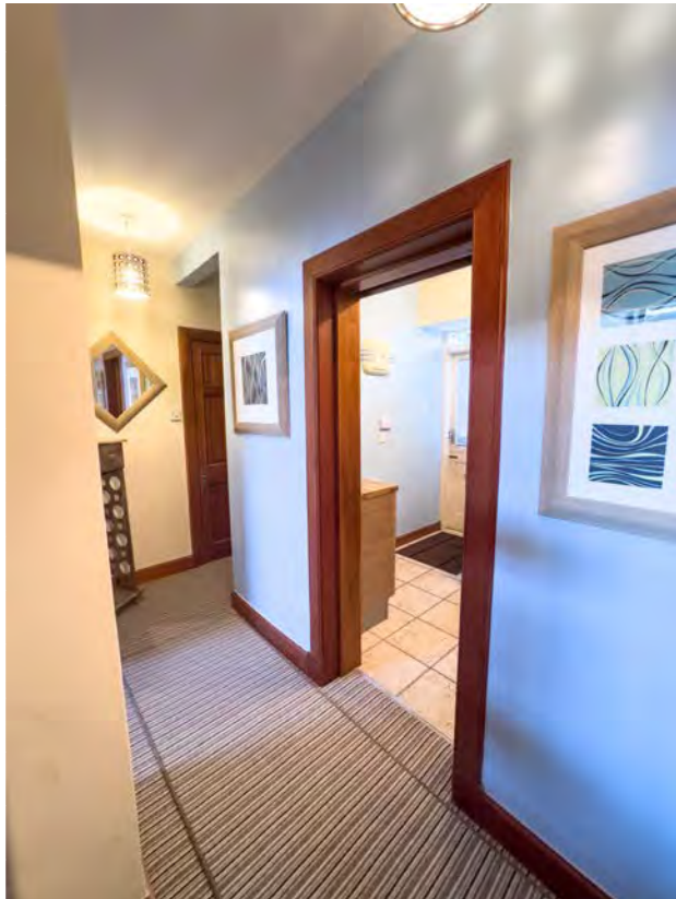
LOWER WEST FLAT, BRUCE BUILDINGS, HIGH STREET, FALKLAND