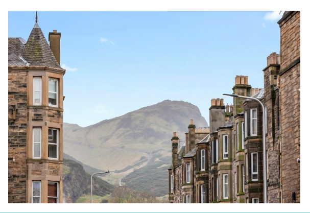
Smart Property is a trading name of Temple & Co Solicitors, SC415576, Registered office: 1 St Colme Street, Edinburgh, EH3 6AA